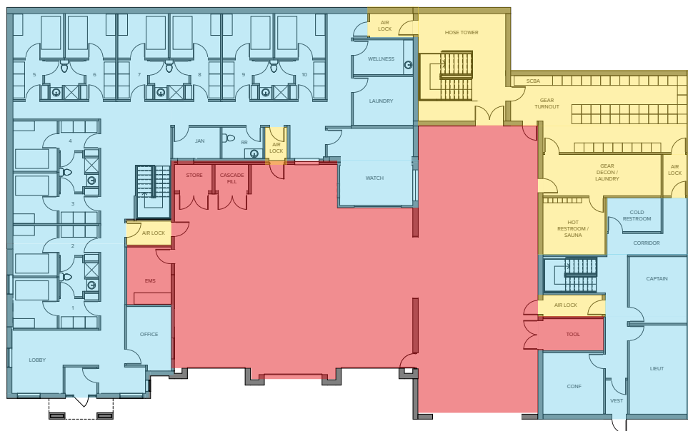
Westfield Station 82 Decon Zone Diagram