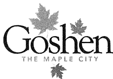
Exhibit C for 10 Aug 2020 Board of Works Minutes